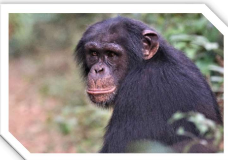
Chimpanzee ( Pan troglodytes verus ).

McClusky B, Agnew D. Spermatogenesis in Mexican wolf testis of differing ages. MSU CVM Phi Zeta Day, East Lansing, MI (virtual). 2-23 October 2020.