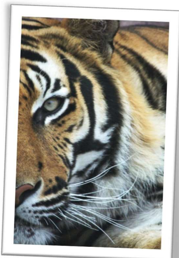
Tiger ( Panthera tigris ).

reproductive organs. The RHSP archive will contribute valuable data to this project.