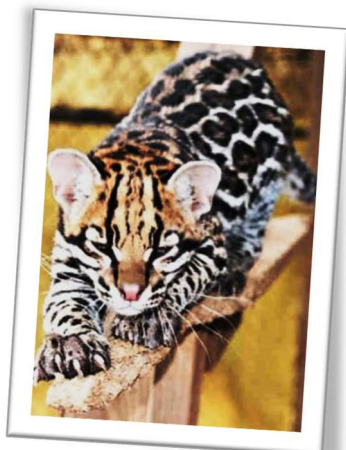
Ocelot ( Leopardus pardalis ).

The RHSP is collaborating with the Exotic Species Cancer Research Alliance ( ESCRA ), to investigate the prevalence of cancer in felids. In a previous publication, an increased risk of neoplasia was documented in Panthera felids compared to non-Panthera felids ( https://doi.org/10.3390/ani10122376 ). Following this publication, questions arose about whether contraceptives might differentially affect large vs small felids and whether contraceptives could affect non-