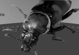
American burying beetle