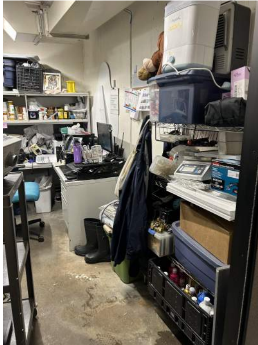
PHOTOS OF EXISTING STORAGE ROOM