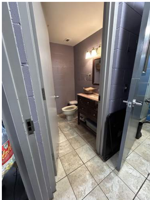
PHOTOS OF EXISTING SHOWER AND LOCKER ROOM