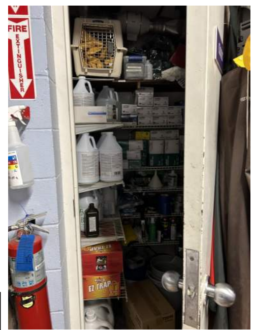
PHOTO OF EXISTING JANITOR CLOSET